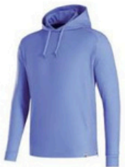
Additional Men Jacket $ 80 .00