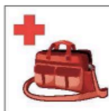
Medically Necessary and Diaper Bags*

*Infant and Medical supplies will be permitted after proper inspection.