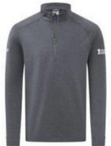
Volunteer MEN Jacket - 4XL

BOTTOMS: MUST BE KHAKI PANTS, SHORTS, SKORTS *COME PREPARED FOR THE WEATHER*