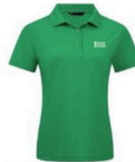
Volunteer WOMEN Polo