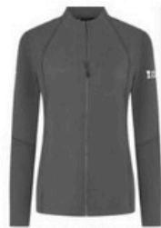
Volunteer WOMEN Jacket - 2XL