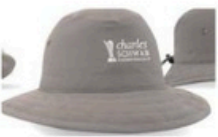
Bucket Floppy Hat $ 30 .00