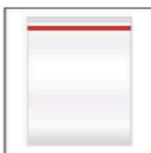
1-Gallon Plastic Freezer Bag