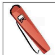
Folding Chair Bag (Folding Chair is Allowed)

FOR MORE INFORMATION GO TO PGATOUR.COM/ProhibitedItems