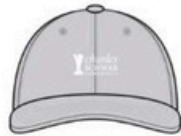
Volunteer Baseball Hat