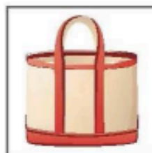
Over-sized Tote Bag