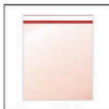
Tinted Plastic Bag