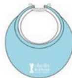
Volunteer WOMEN Visor