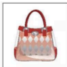
Printed Pattern Plastic Bag