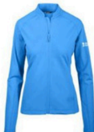
Volunteer WOMEN Jacket