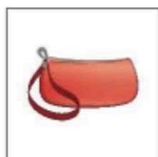
Bags smaller than 6"x6"x6"