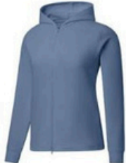
Additional Women Jacket $ 80 .00