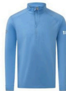
Volunteer MEN Jacket