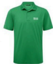
S - 3XL Kelly Green