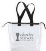
Volunteer Clear Tote