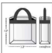
Clear Bag smaller than 12" x 6" x 12"